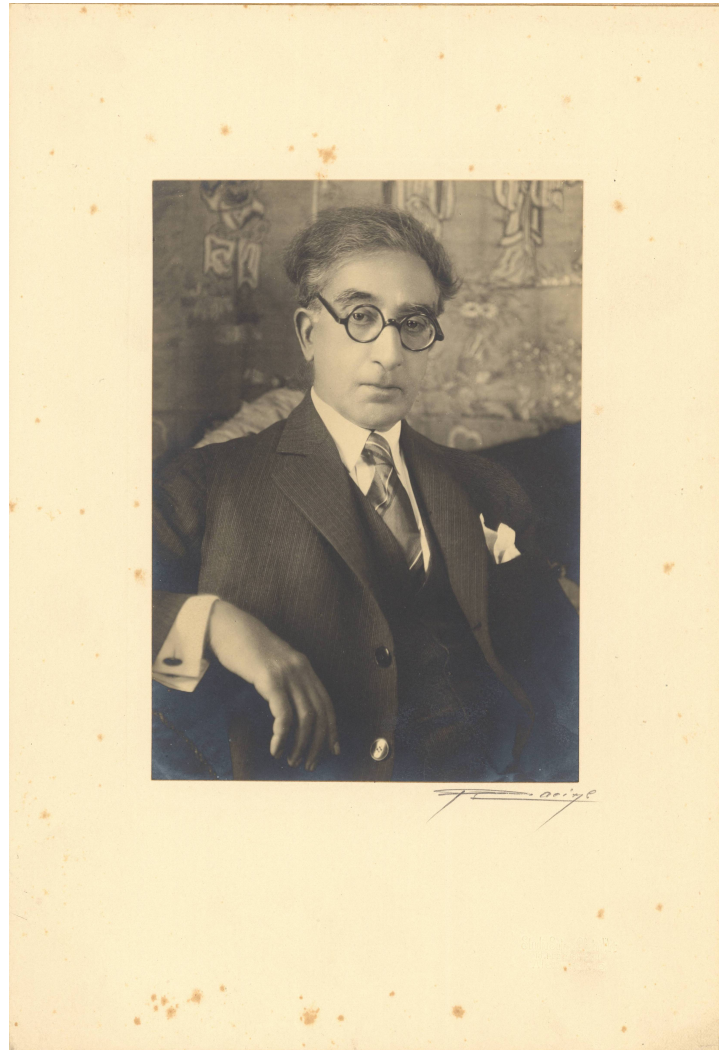
Photographic portrait of C.P. Cavafy at a mature age.

Cavafy was intentional about his work's refusal to be pinned down: he resisted becoming part of the publishing market both in Greek and in English, despite many attempts by literary figures in several countries to convince him to share his work widely—yet he archived and annotated everything as though waiting for the expanded worldviews of future readers. He insisted on self-publishing, creating pamphlets of his work, and giving poems to those who visited him in Alexandria. Visiting Cavafy therefore became a destination of the literati: the best way to experience his work was through him directly. “Archive of Desire” convenes some of today's most category-defying artists to further interpret Cavafy's prismatic legacy—propelling it even further into the future, and revisiting it as a fertile source for inspiration anew.