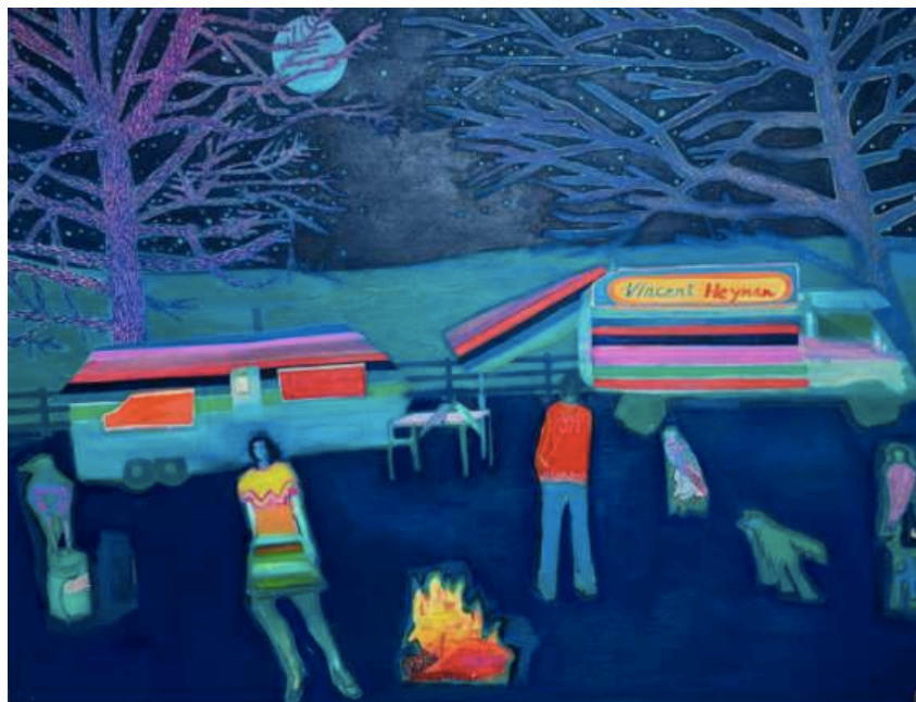
Tom Hammick, Art Life , 2020, oil on canvas, 150 x 200 cm