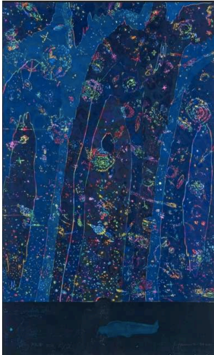
Tom Hammick, Sky Park , 2020, edition variable reduction woodcut, 167 x 101 cm