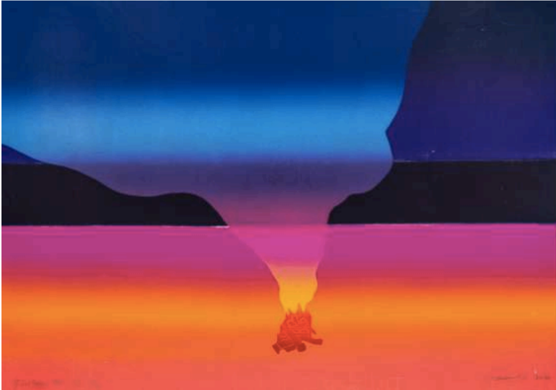
Tom Hammick, Tristan's Fire , 2020, edition variable reduction woodcut, 102 x 142 cm