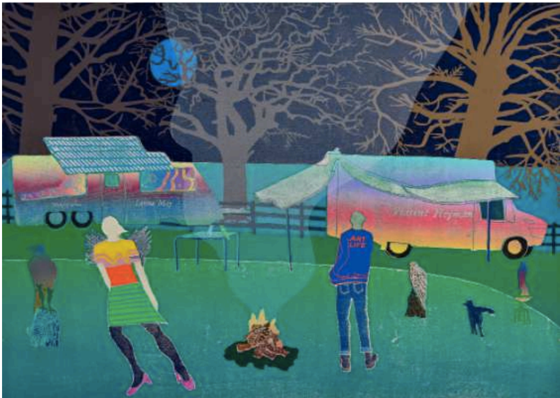
Tom Hammick, Art Life , 2020, edition variable reduction woodcut, 100 x 140 cm