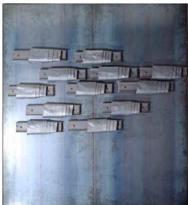
Jannis Kounellis, Senza titolo, 1989 iron and lead 183 x 206 x 12 cm