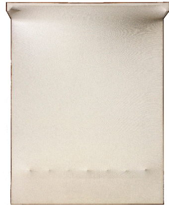
Enrico Castellani, Superficie bianca n°5, 1964 tempera on shaped canvas 146 x 114 x 30 cm