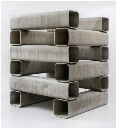
Alighiero Boetti, Catasta, 1967-92 12 elements in Eternit, 187 x 150 x 150 cm