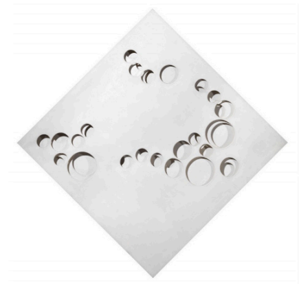
Paolo Scheggi, Intersuperficie curva bianca, 1967 acrylic on three shaped canvases 140 x 140 x 7 cm