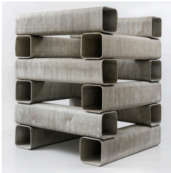
Alighiero Boetti, Catasta , 1967-92, 12 elements in Eternit, 187 x 150 x 150 cm