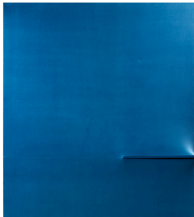
Agostino Bonalumi, Blu, 1972 tempera on shaped canvas 180 x 160 cm